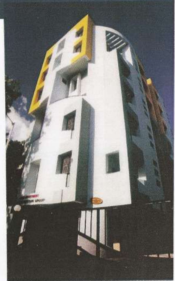
The front elevation of Gauri Apartments.

Framing of the form yet giving an openness to the terrace. All side ducts are used for the services such as rain water, toilet inlet, outlet connections.