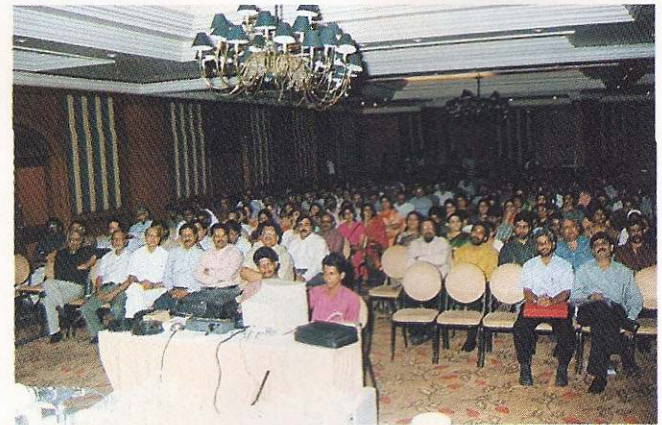
A section of the huge gathering of architects and invitees at the award function.