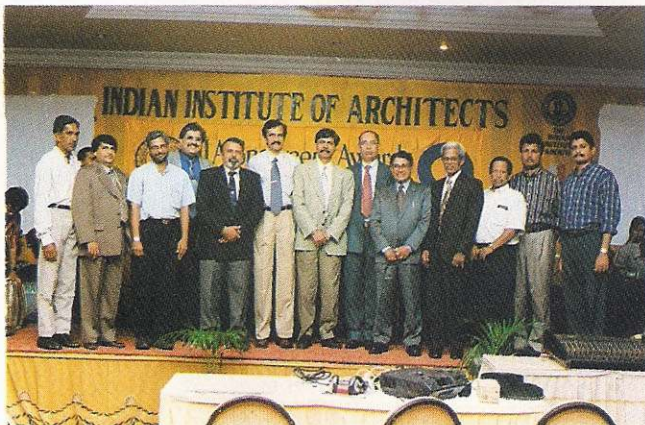
A group photograph of IIA office bearers, SIL and KNL officials and the award winners.